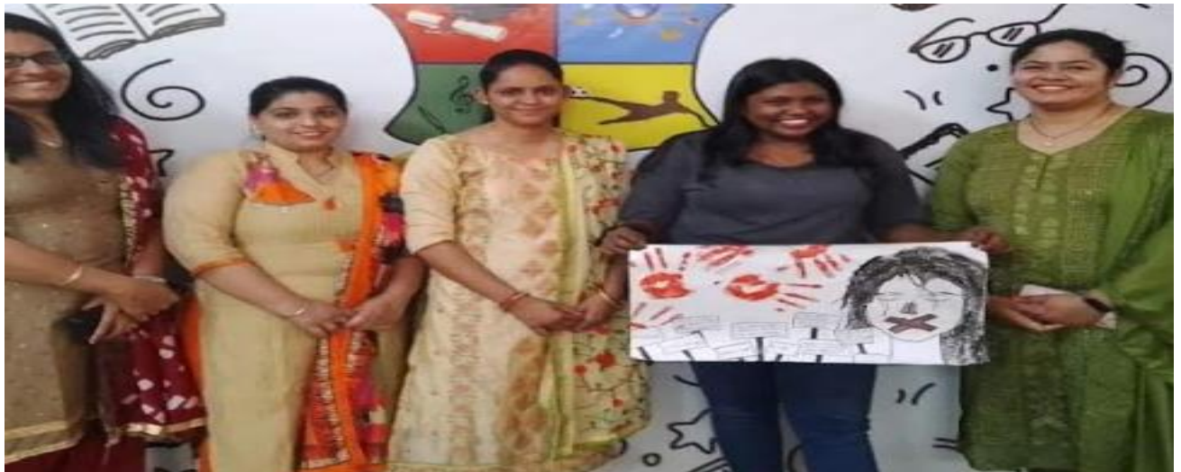
Poster Making Competition