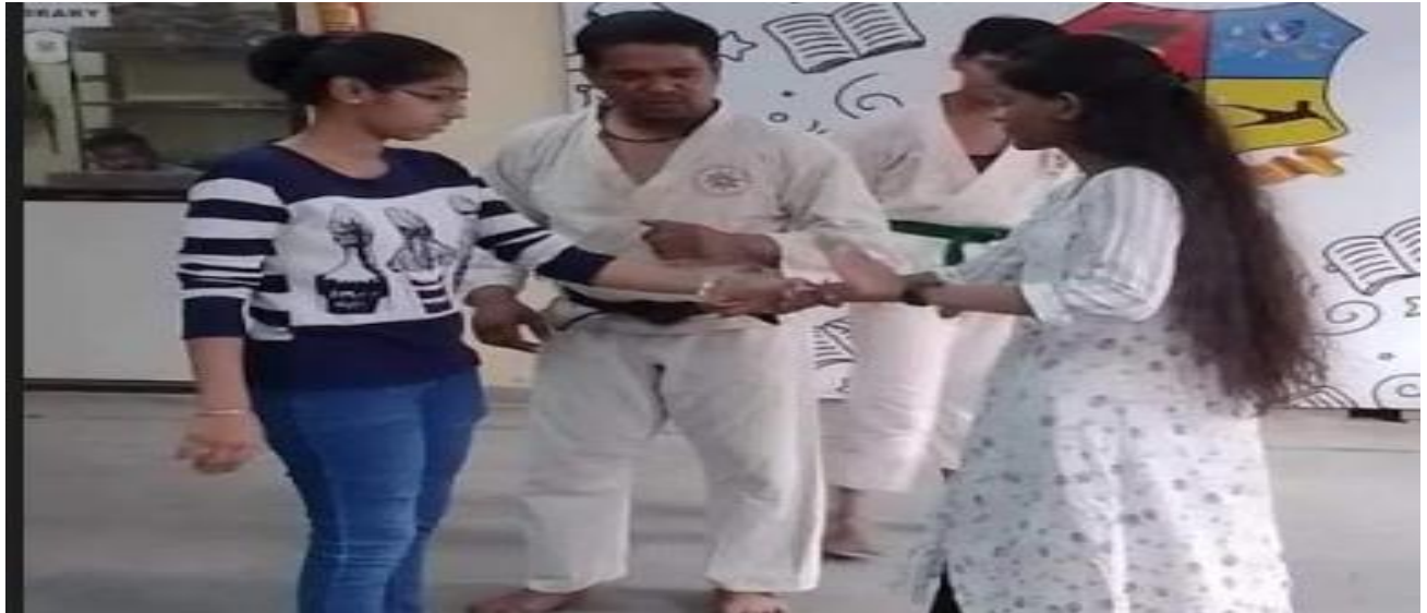
Self Defense Training