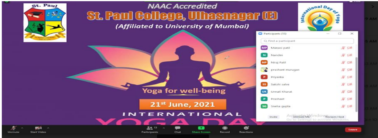
International Yoga Day Celebration