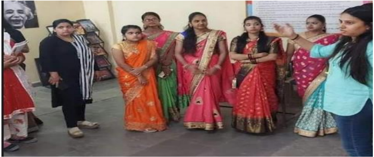
Saree Draping Contest