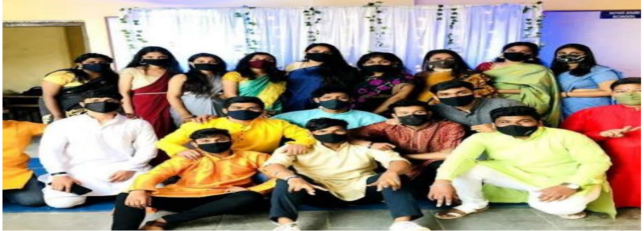
Saree / Kurta Day