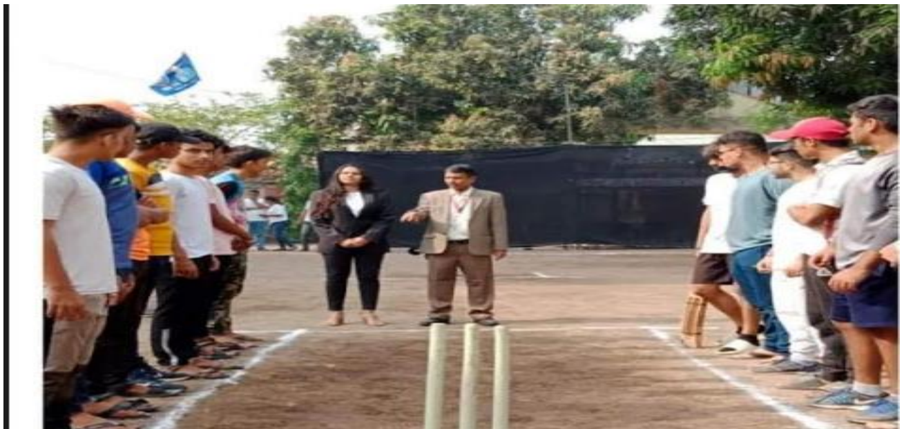
Inter Collegiate Cricket Competition