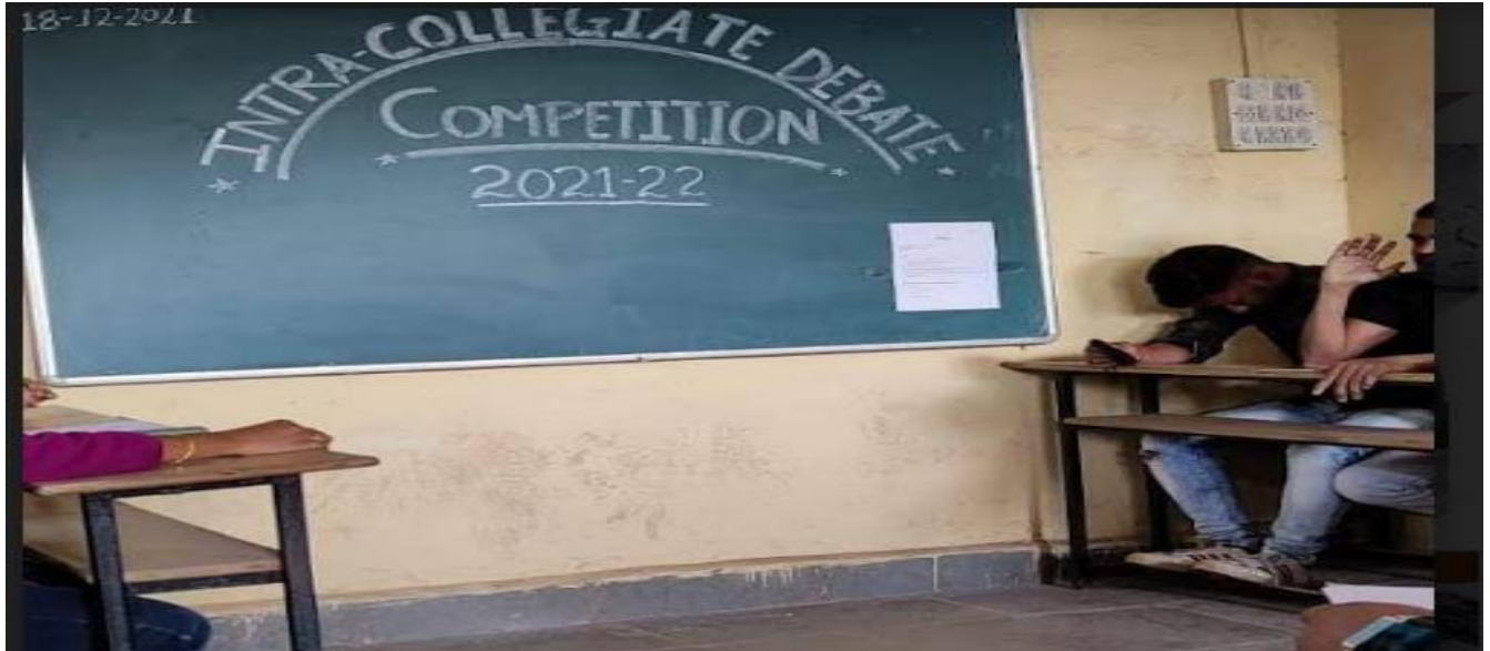
Intra Collegiate Debate