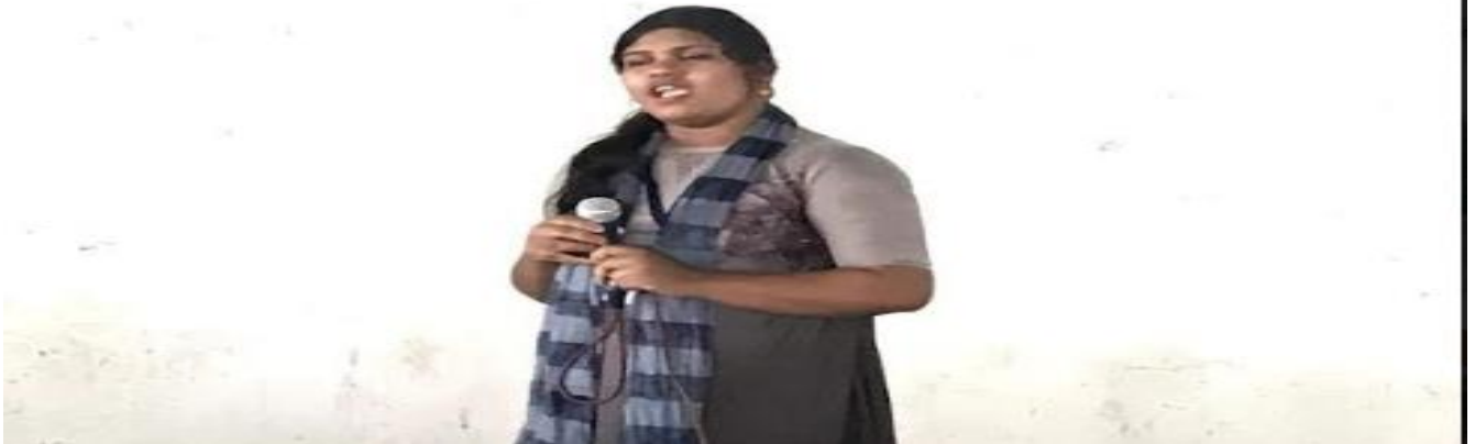
Intra Collegiate Singing Competition