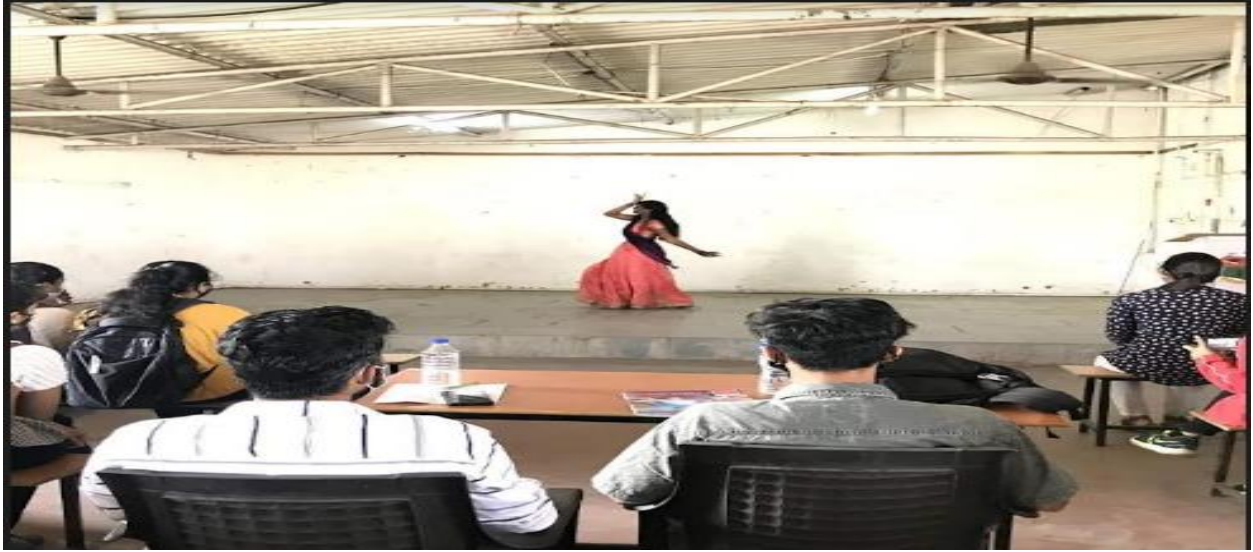
Intra Collegiate Dancing Competition