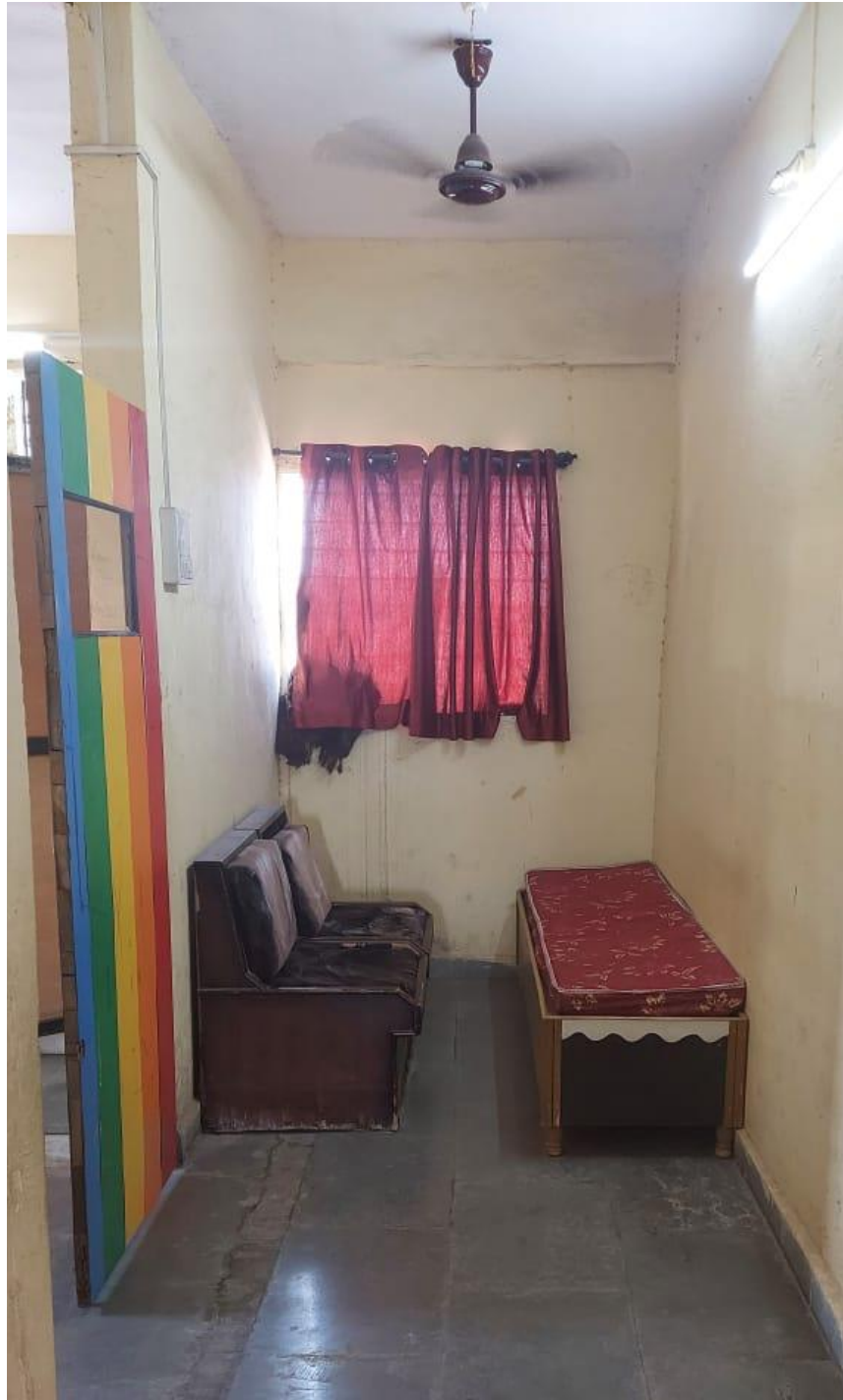
Girl Common Room