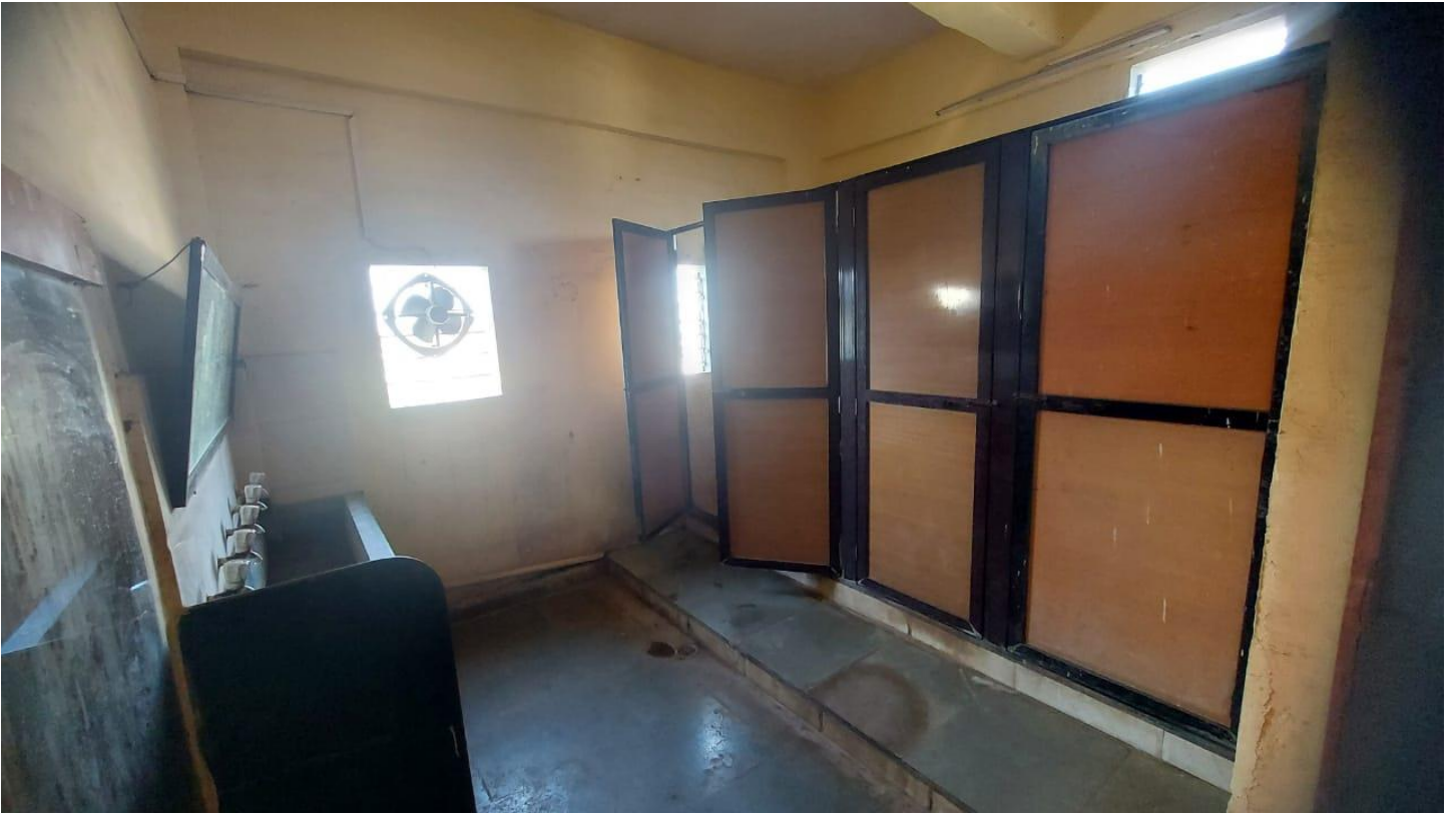
Girl Washroom Room