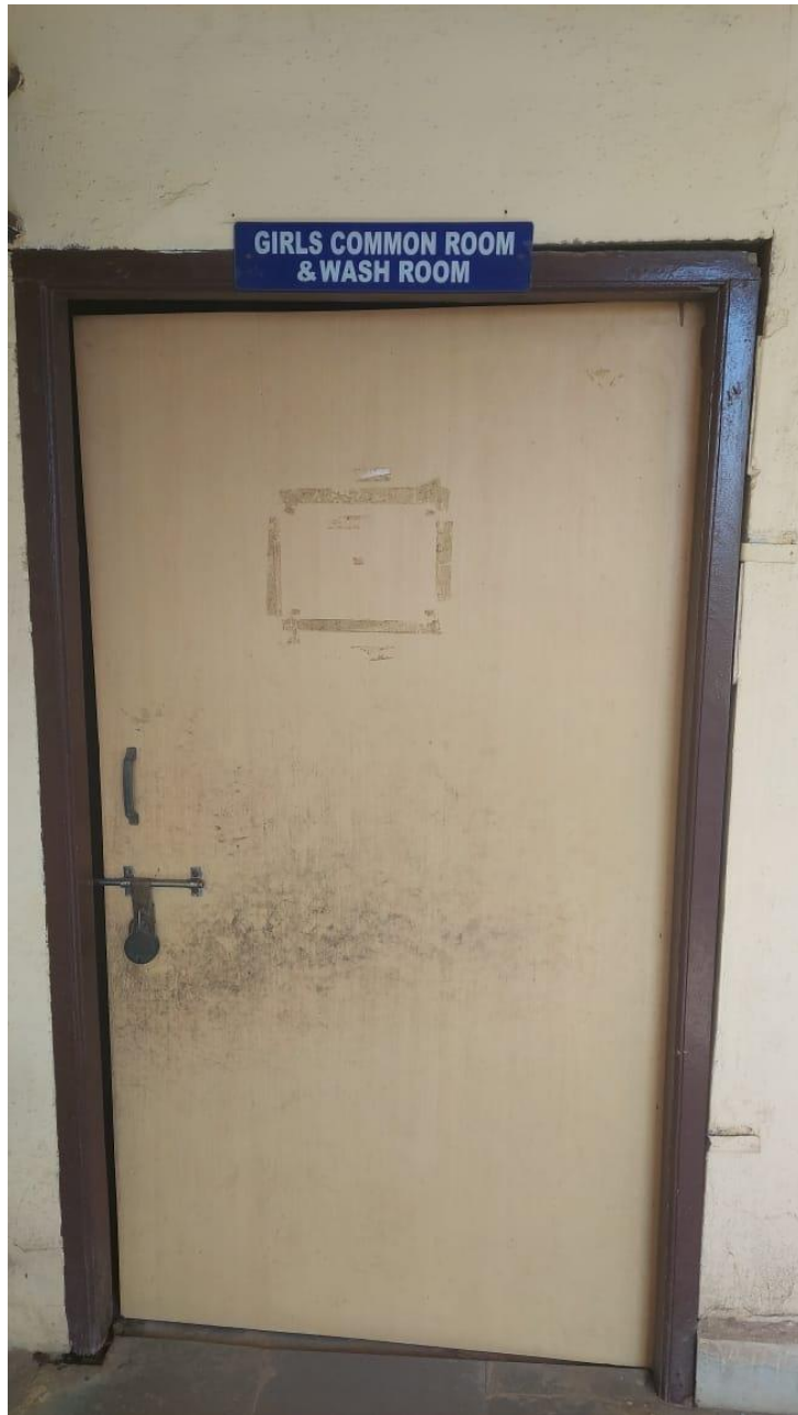
Girl Washroom & Common Room